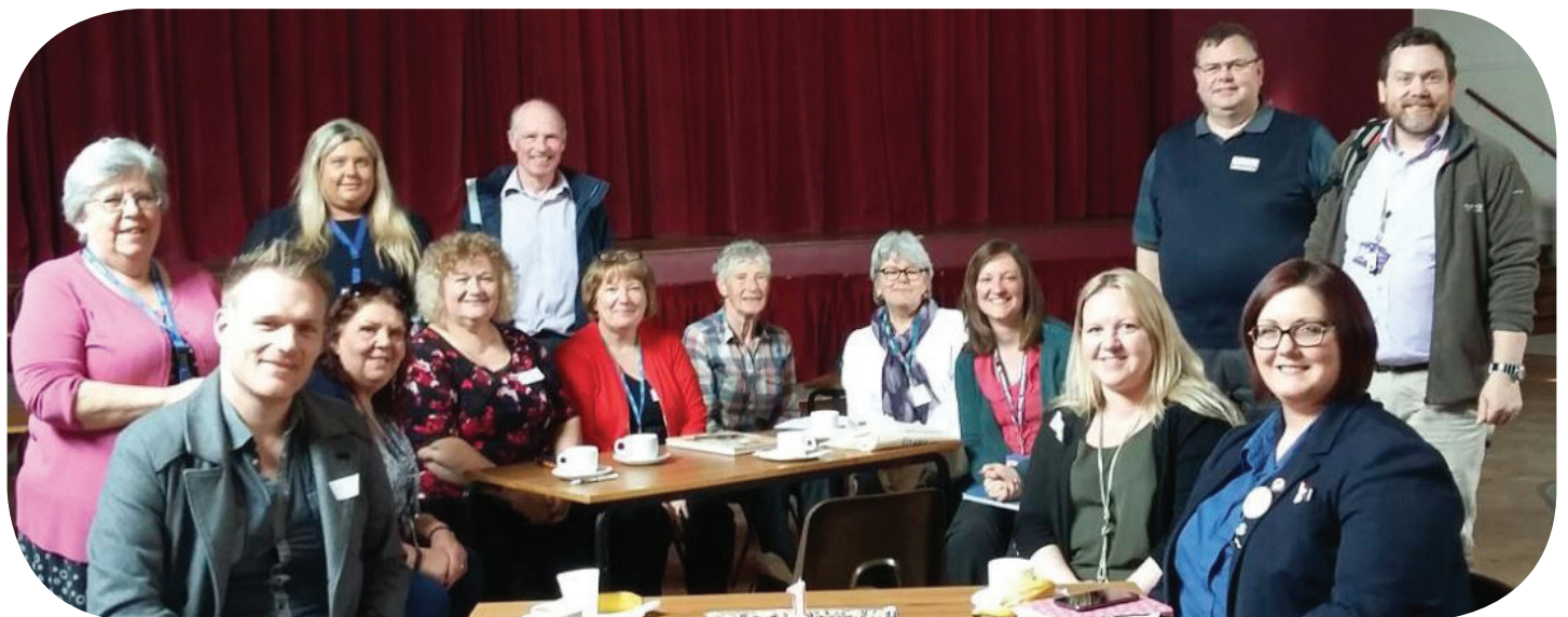
Community Development Workers Network Meeting

So what have Healthy Fenland helped to get started?