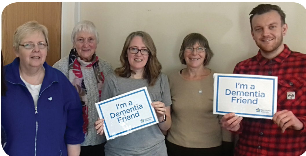
Dementia Friends after their Training